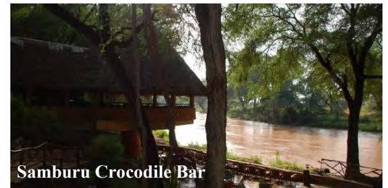
Samburu Crocodile Bar