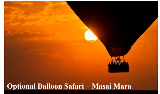
Optional Balloon Safari – Masai Mara